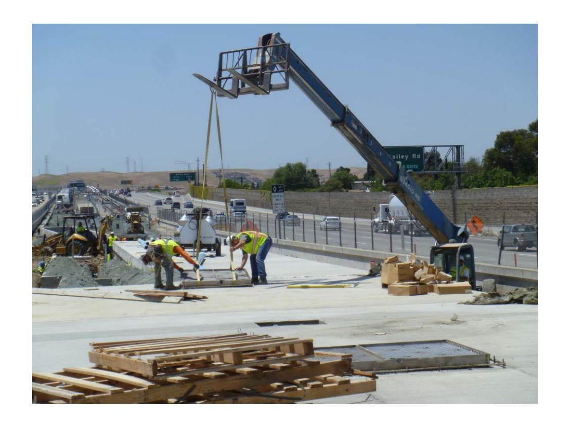
Installation Of Access Hatches. Transfer Platform. May 29, 2012.