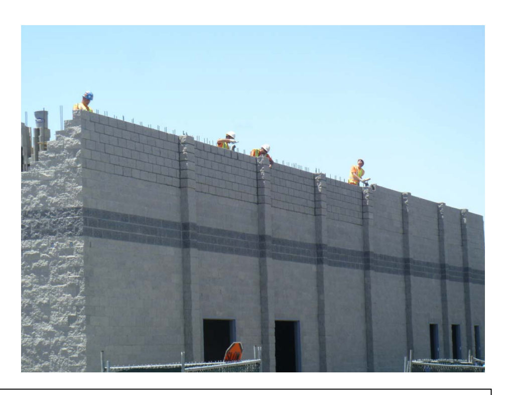
Completing CMU Block Installation. Ancillary Building. May 29, 2012.