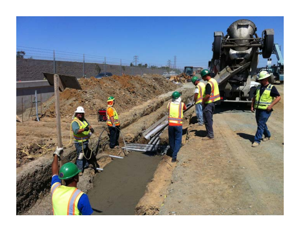
Encasement Of Communications And Power Ductbank. June 1, 2012.