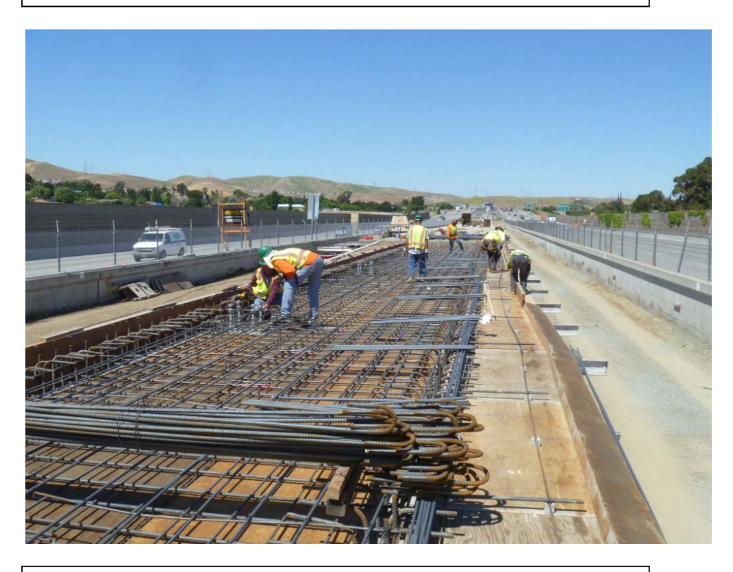
Reinforcing Steel Installation At Transfer Platform. May 23, 2012.